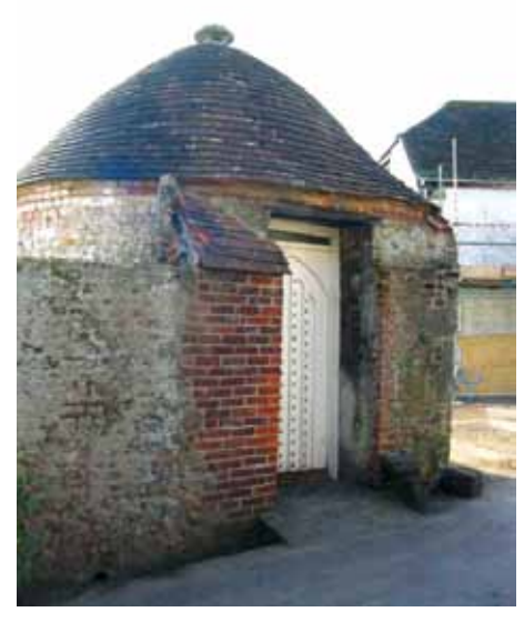
Warminster Blind House