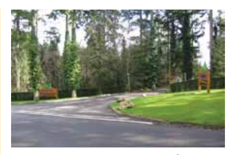
Entrance to Center Parcs, Longleat Forest