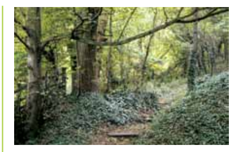
Arn Hill Nature Reserve, Warminster