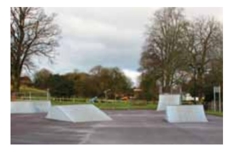
Skate Park, Lake Pleasure Grounds, Warminster