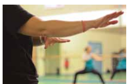
22% of adults take part in three x 30 minutes of moderate exercise per week