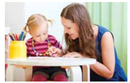
Against national comparators, Warminster Community Area has a lower level of child poverty