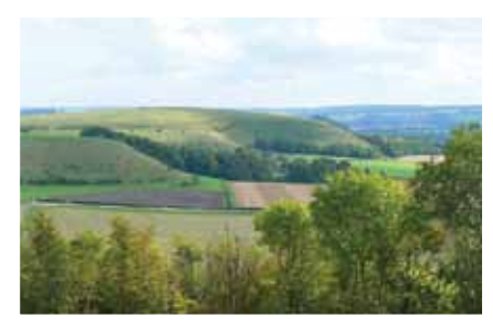
Scratchbury Camp, as viewed from Battlesbury Hill